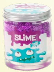
SLIME WITH FOAM BALLS

counter display: W27 cm x D17 cm x H 23 cm